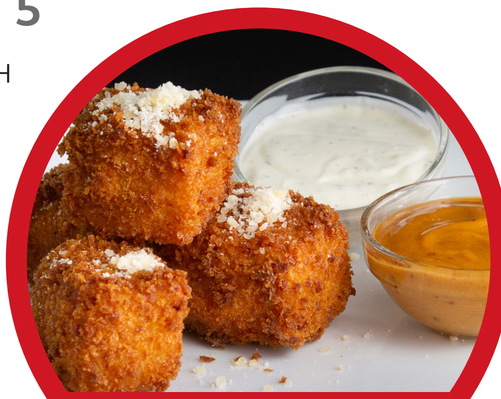
MAC & CHEESE BITES

3 CHEESE MAC & CHEESE BITES 6 PARMESAN//MOZZARELLA//CREAMY CHEDDAR//SEASONED PANKO BREAD CRUMBS//CHIPOTLE AIOLI//HOUSE-MADE RANCH