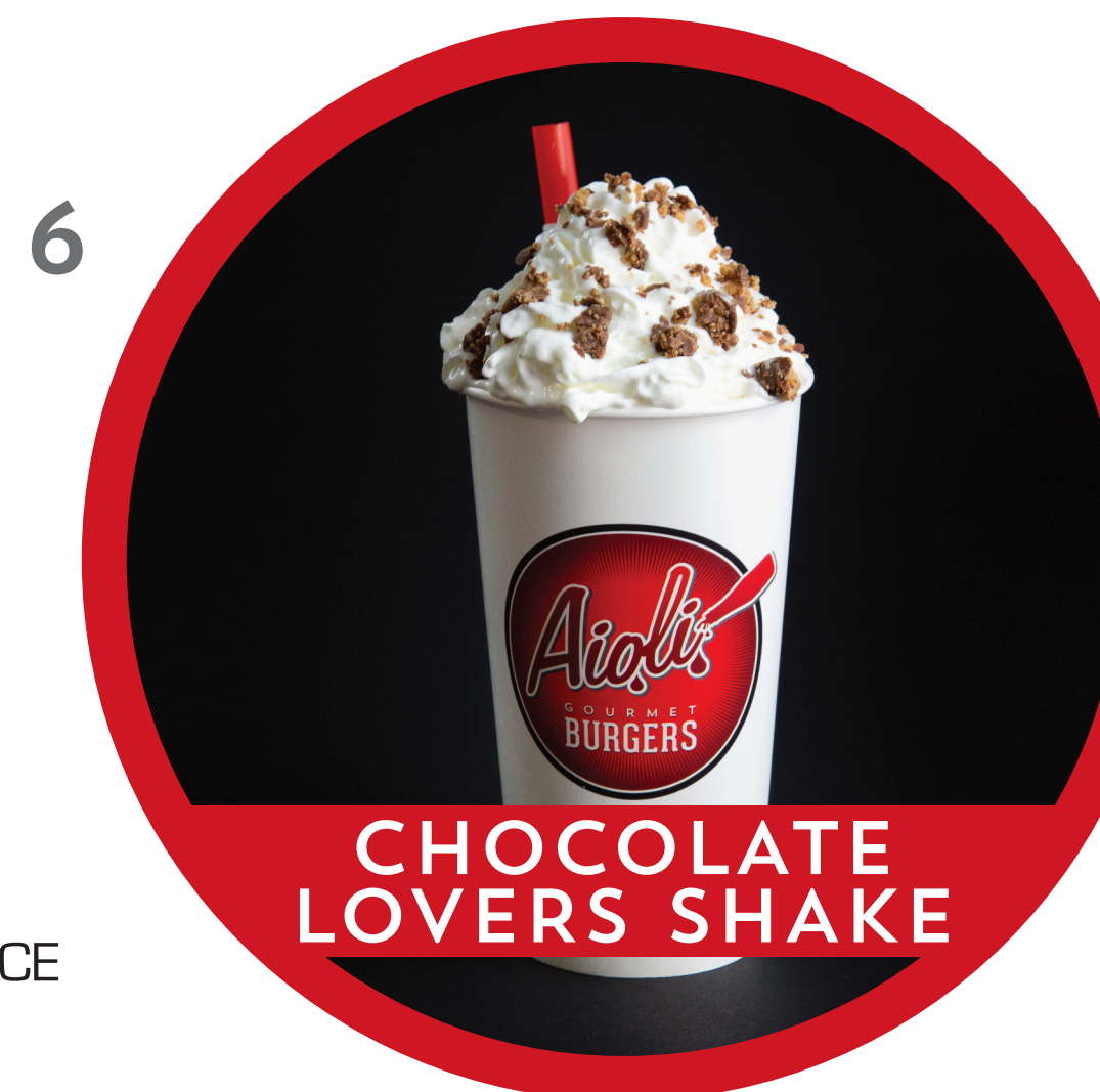
CHOCOLATE LOVERS SHAKE

CHOCOLATE LOVERS SHAKE 6 DOUBLE CHOCOLATE ICE CREAM//HEATH BAR CRUNCH//BROWNIE PIECES//CHOCOLATE DRIZZLE//FRESH WHIPPED CREAM