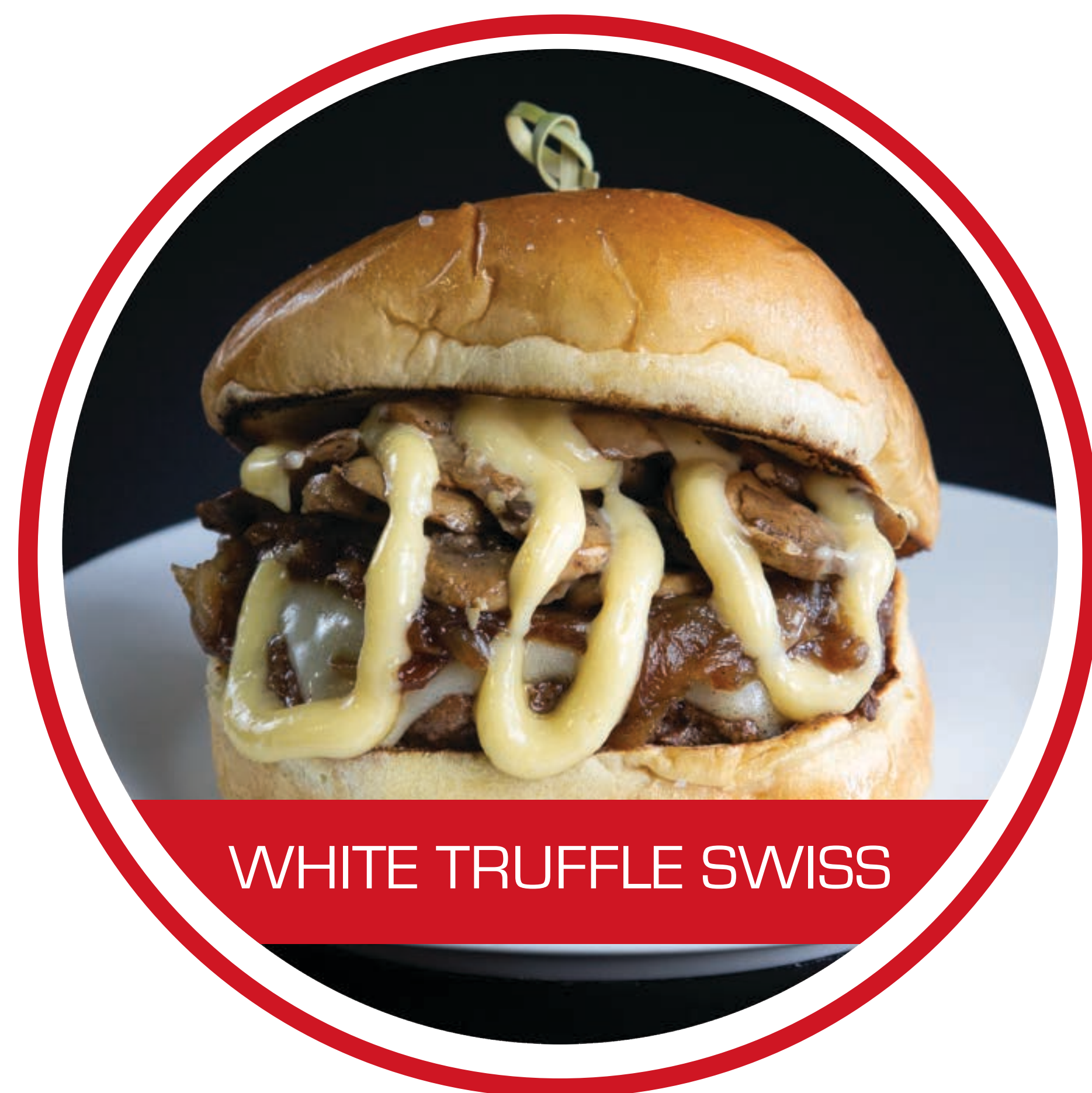
WHITE TRUFFLE SWISS