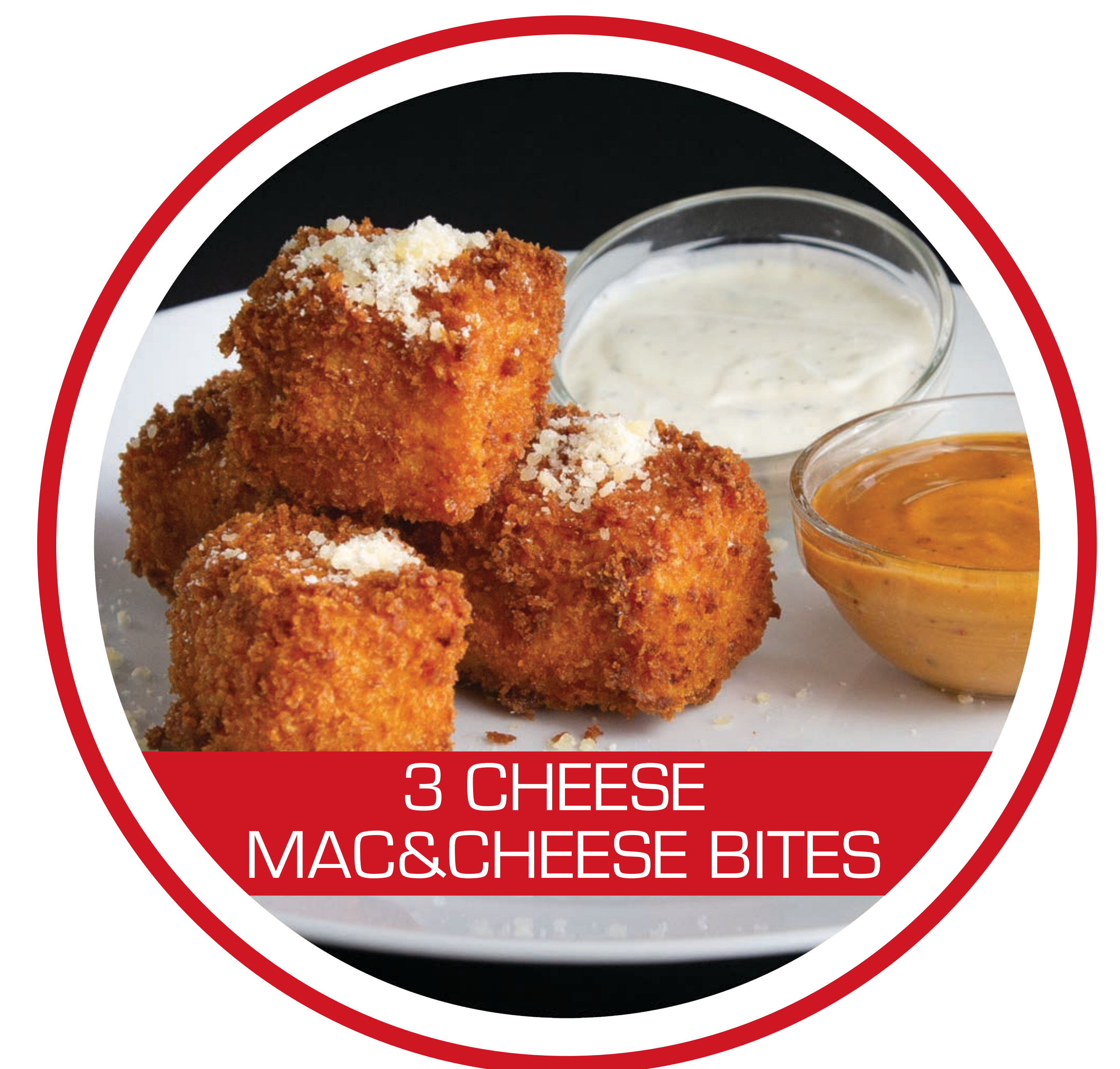
3 CHEESE MAC&CHEESE BITES