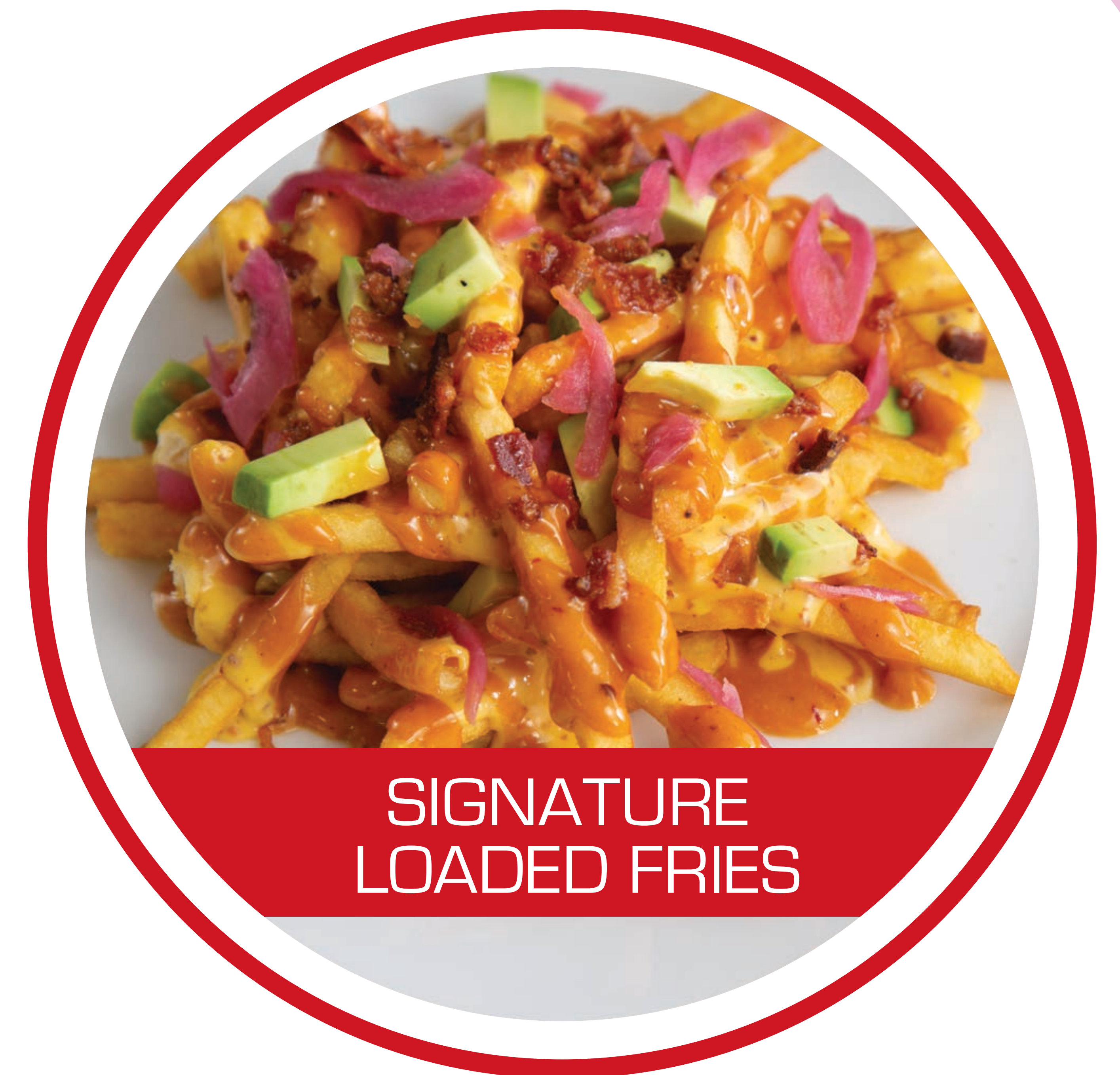
SIGNATURE LOADED FRIES