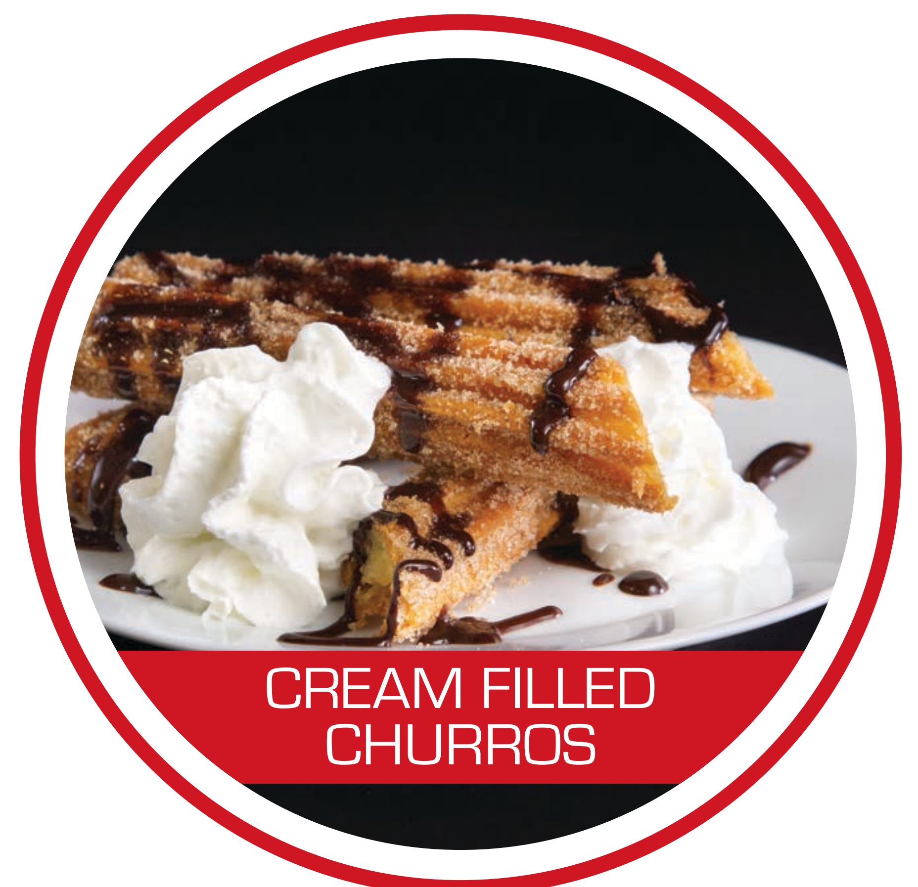
CREAM FILLED CHURROS